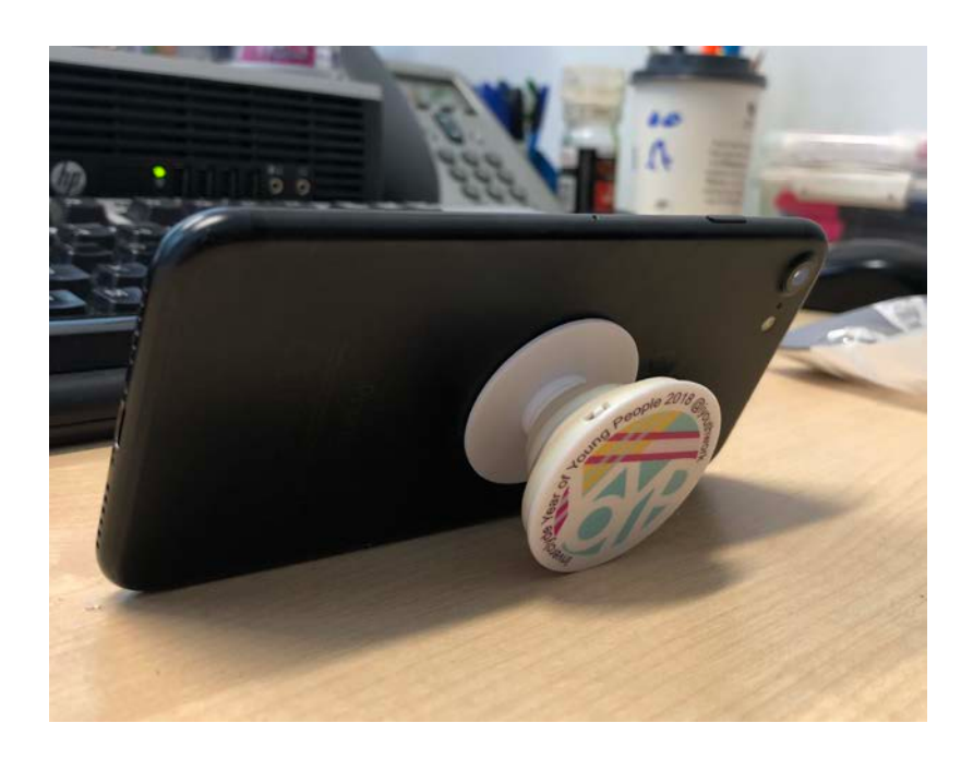
(Every young person in Inverclyde from P7 – S6 has been given a mobile phone pop socket to promote YoYP to young people)